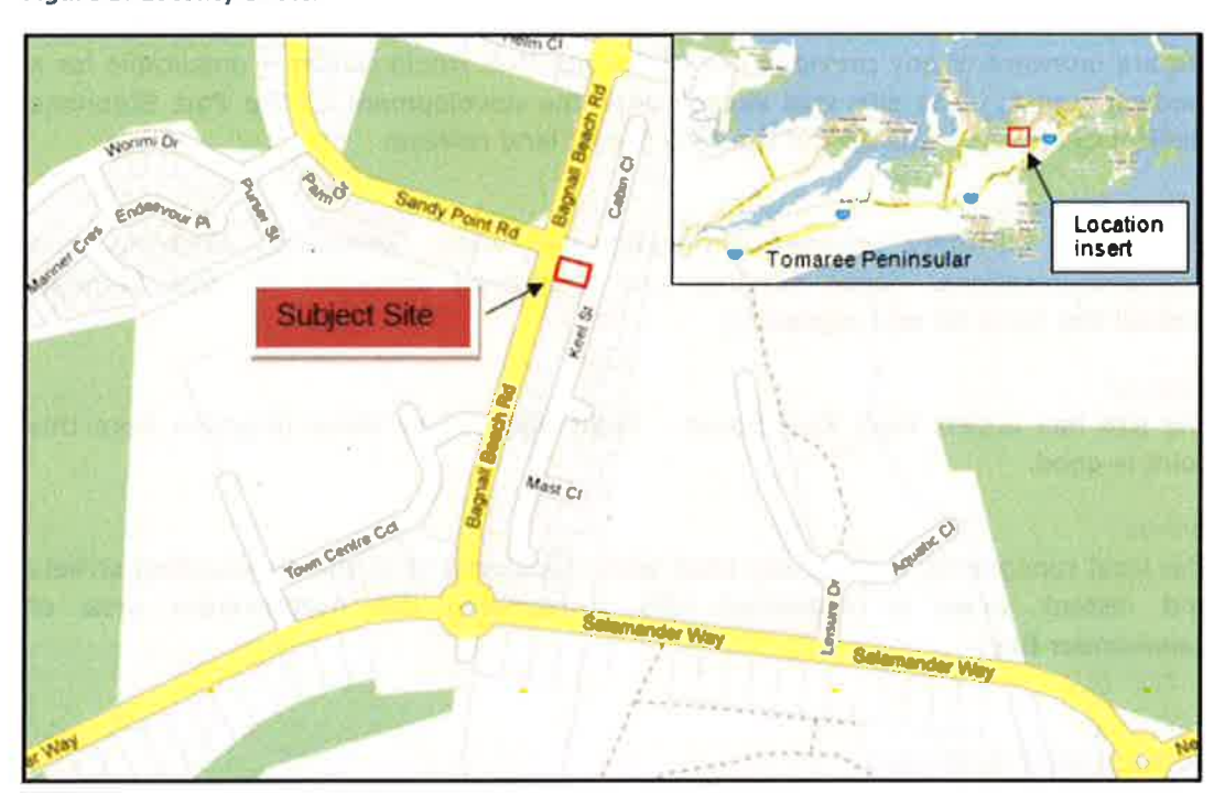
Figure 1: Locality Sketch

• Part 4 - Details of the Community Consultation that is to be undertaken for the planning proposal.